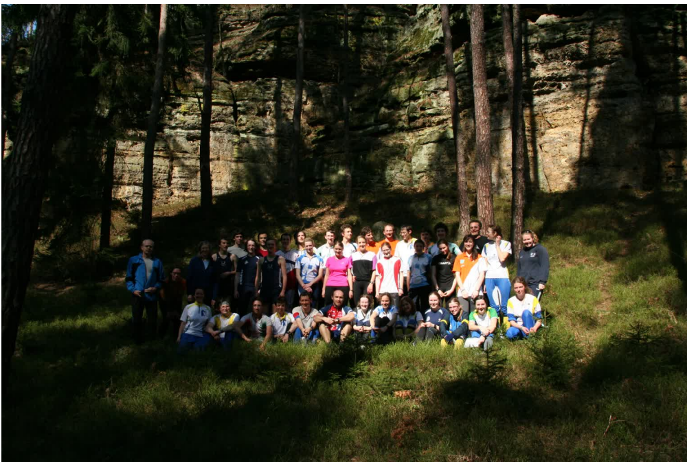
Everyone at the Czech Varsity Relays 2011