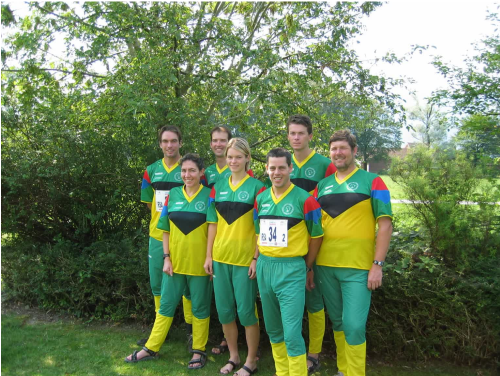
South Africa O Team, WOC 2005 [Ian Bratt]