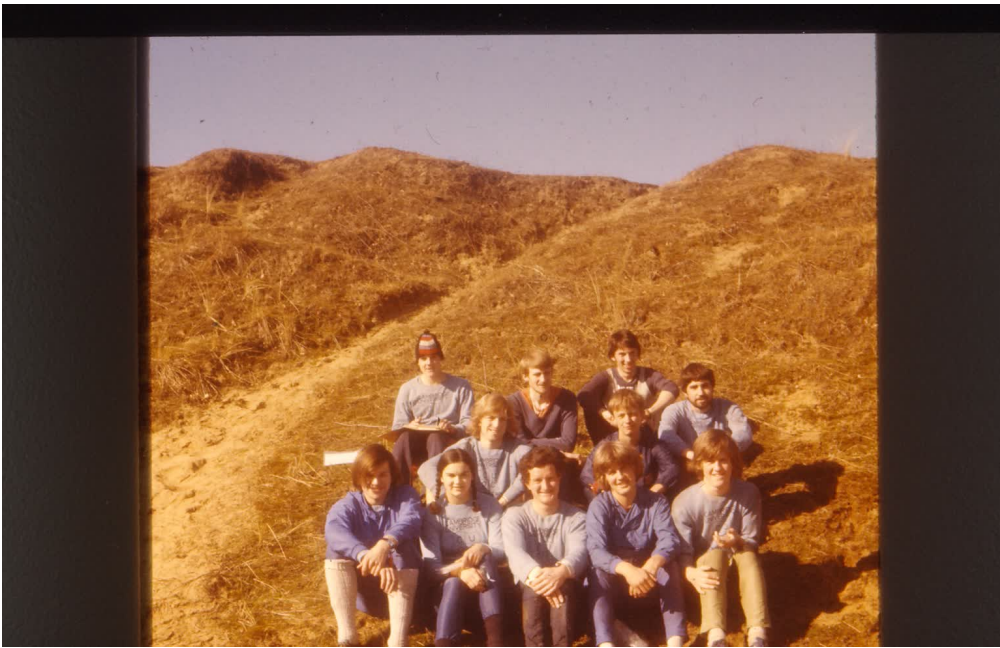
Merthy Mawr training 1979