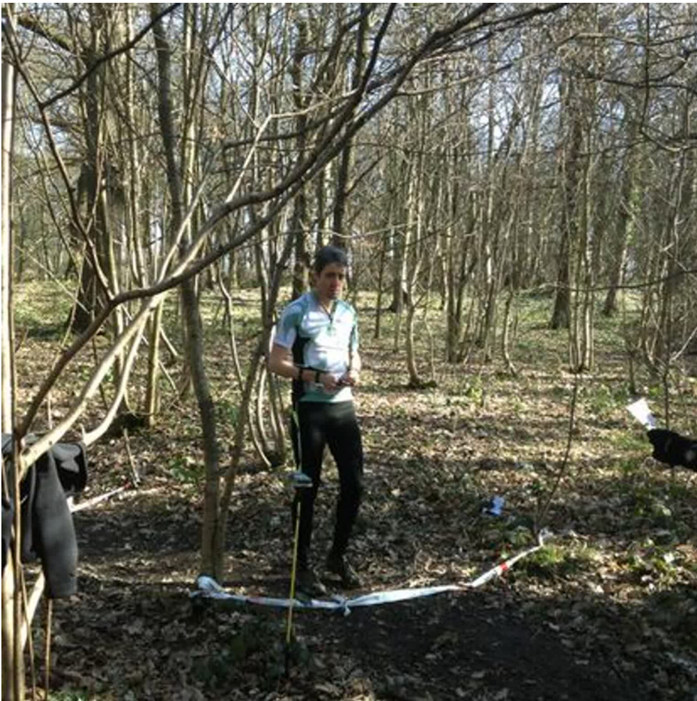
Varsity Blues [Rob Campbell]