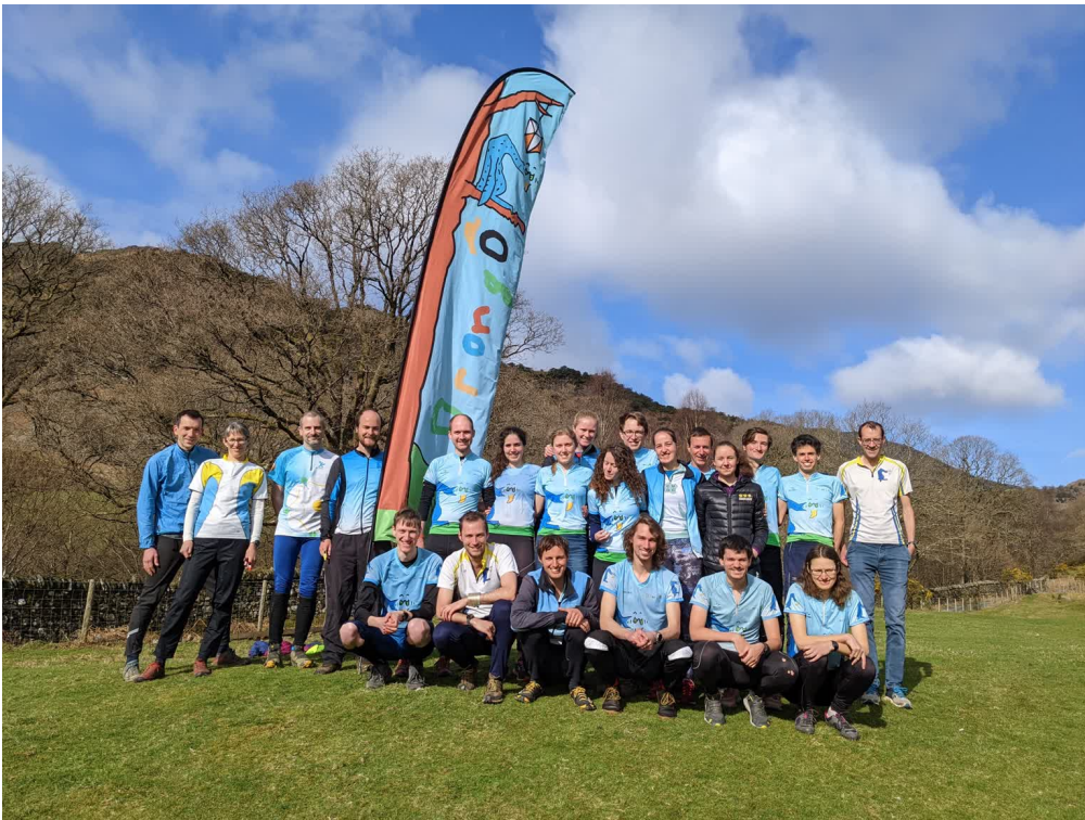
Drong0 at Varsity 2022 in the Lake District [Ben Windsor]