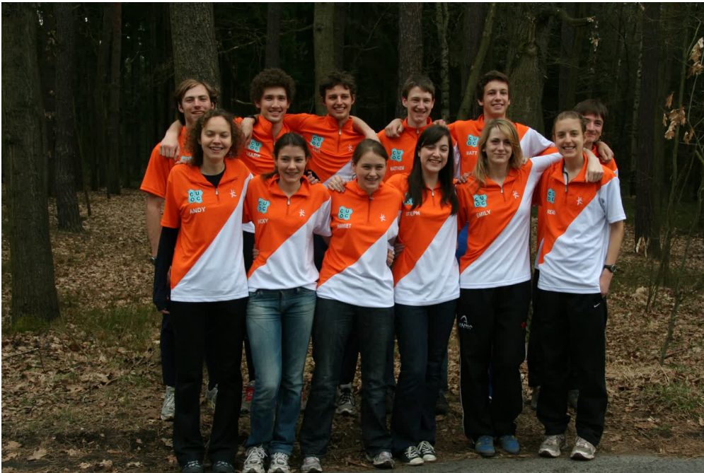
The Czech 2011 Varsity Team, the kites were upside-down though!