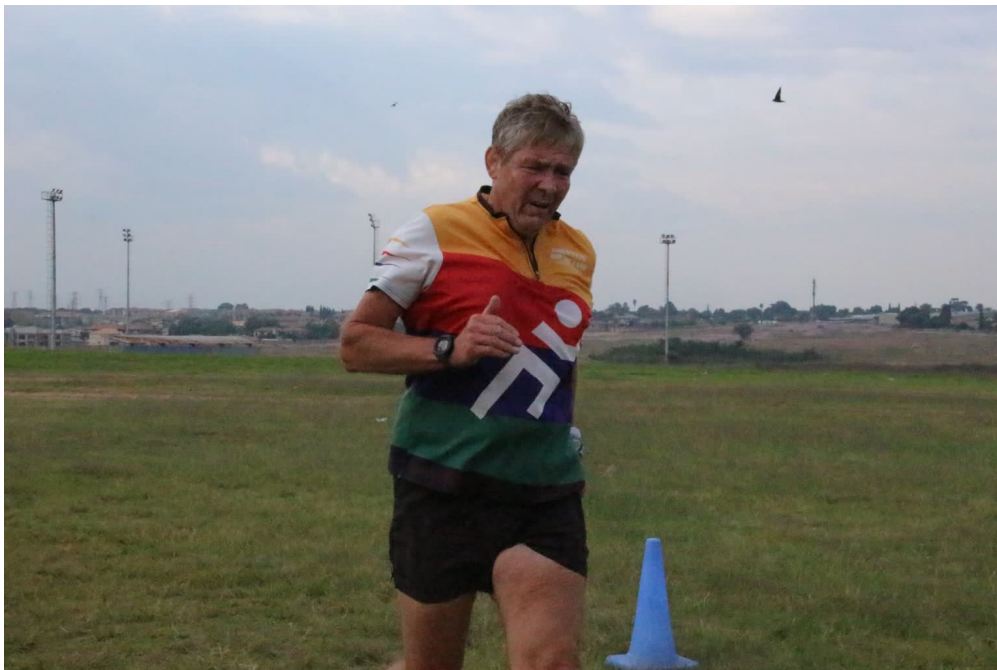
Park run, Apr 2022 [Ian Bratt]