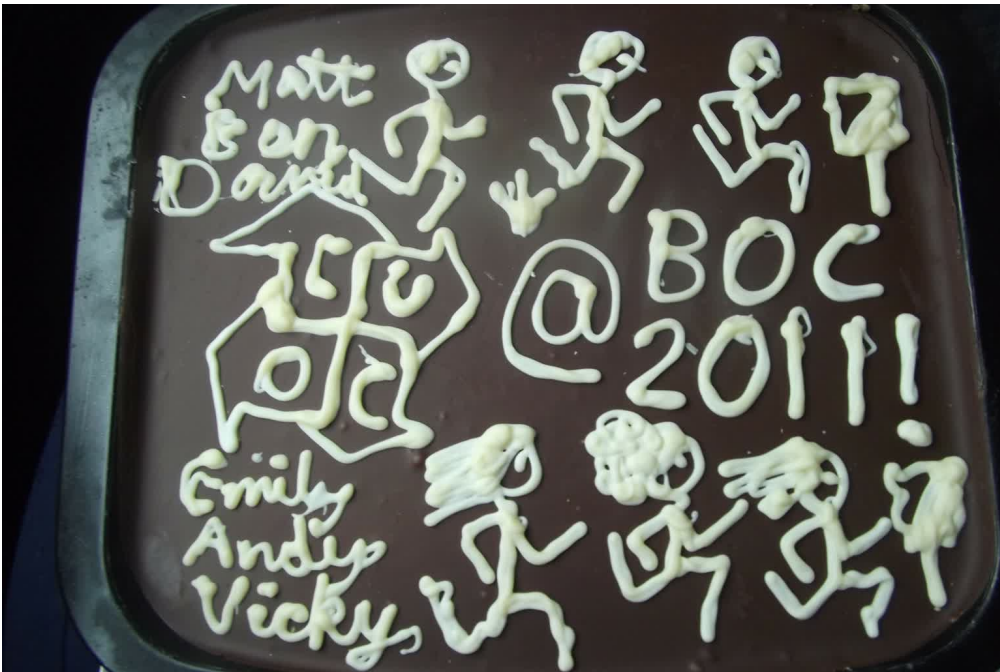
Race preparation for the British Champs 2011 [Ben Windsor]